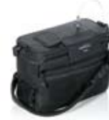
Black carrying case 900-200