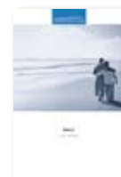
User manual 900-098